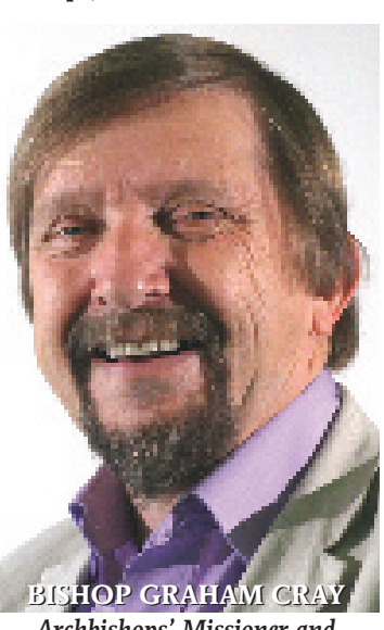
Archbishops' Missioner and Leader of the Fresh Expressions team (Closing Reflections)